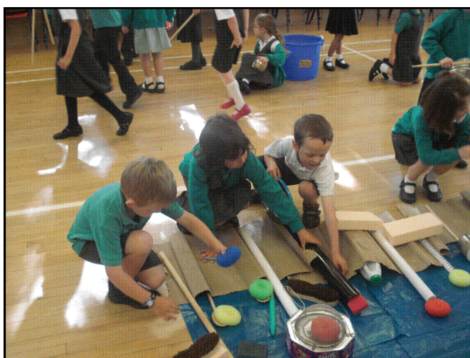
Infant children creating musical instruments as part of the IMAP project.

We enrich the curriculum for the children by having special days and focused weeks, as well as visits and visitors throughout the year. There are clubs that operate at lunchtimes and after school and children in Key Stage 2 are offered peripatetic music lessons for which a charge is made. Details of these lessons are made available to the children and parents usually at the beginning of term.