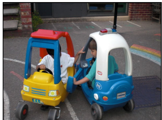
Infant children in the reception playground.

The original building in Church Lane dates back to 1849 when there were just two school rooms, one for boys and one for girls. Much of the original building can still be seen from the outside.